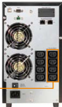
Programmable Outlets (P1) - connect to non-critical devices

With programmable power management outlets, users can easily and independently control load segments. During power failure, this feature enables users to extend battery time to mission-critical devices by shutting down the non-critical devices.