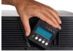
LCD rotatable display