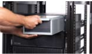
Hot swappable batteries