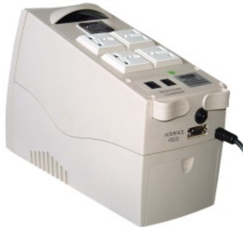
Tejus700 Line Interactive